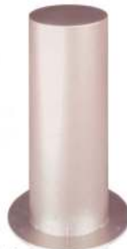
DK/Z STAINLESS STEEL